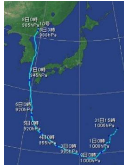
Typhoon No. 10's Path